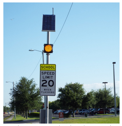
A solar-powered school zone sign

Hillsborough County has integrated solar technology into hundreds of traffic control devices. Beyond simply cutting energy costs and reducing emissions, these solar devices also allow for rapid community response time and location flexibility. The battery storage in these units also makes them exceptionally beneficial for resiliency measures. After Hurricane Irma in 2017, the county began installing solar-powered emergency beacons at key traffic intersections. By the end of 2020, Hillsborough County expects solar to power 550 school zone signs, 300 traffic signals, 100 stop signs, and 40 pedestrian beacons. If conventional power goes out, these devices can continue to function, enhancing public safety during times of emergency.