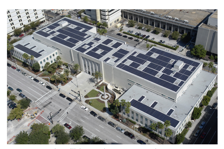
The Hillsborough County Courthouse

For more than a decade, Hillsborough County has been leading an aggressive effort to implement solar energy technologies throughout the community. The initiative was motivated by a desire to cut energy costs, reduce emissions, and create more resilient energy sources that could keep critical infrastructure and services running through hurricanes and other crises. A sustainability grant served as a catalyst for new solar projects, the first of which was the installation of a 195kW rooftop system at the Hillsborough County Courthouse in 2010. That same year, the county installed a 98kW system at All Peoples Life Center Gym. Together, these projects have offset over 6 million pounds of greenhouse gases since their inception.